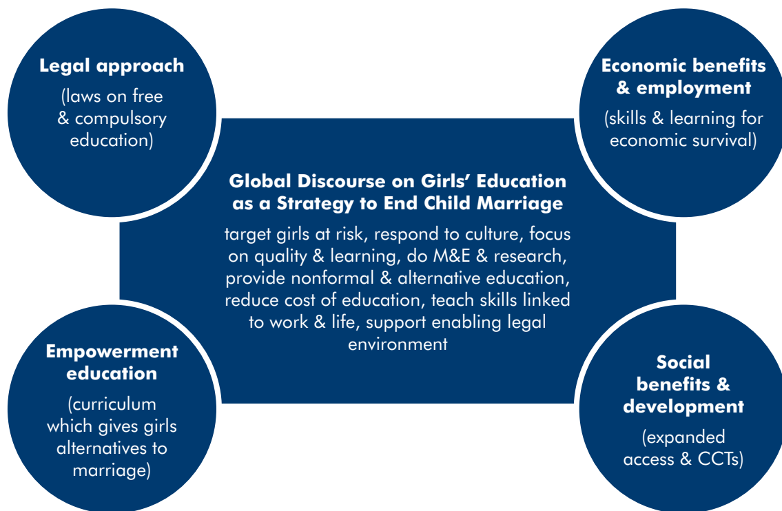
FIGURE 1. APPROACHES TO END CHILD MARRIAGE THROUGH EDUCATION AND EMERGING POINTS OF CONVERGENCE