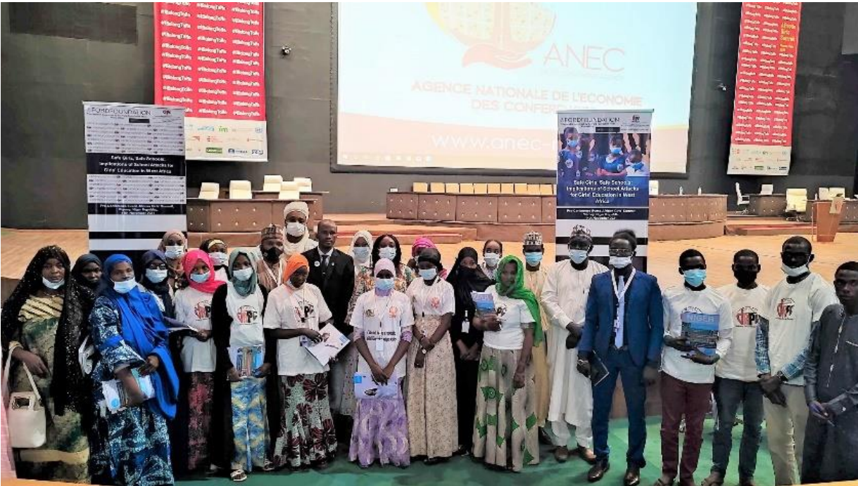
Group Picture of some of the participants of the dRPC's Session on Safe School and Safe Education in West Africa at the 3 rd African Girl Summit in Niamey, Niger