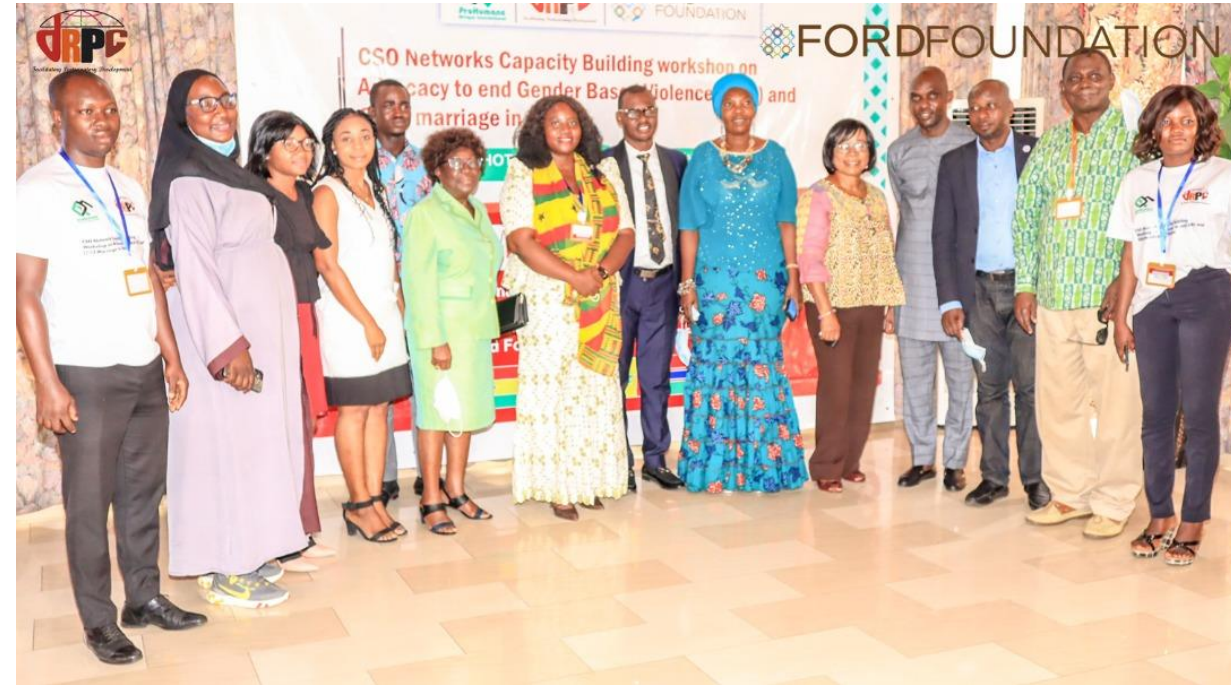
Group Photograph of participants during the workshop

The dRPC in partnership with the ProHumane Afrique International in Ghana is working with participants to fully develop the CSO networks draft action plan for effective implementation of activities aimed at ending GBV and child marriage in Ghana, and West Africa in general.