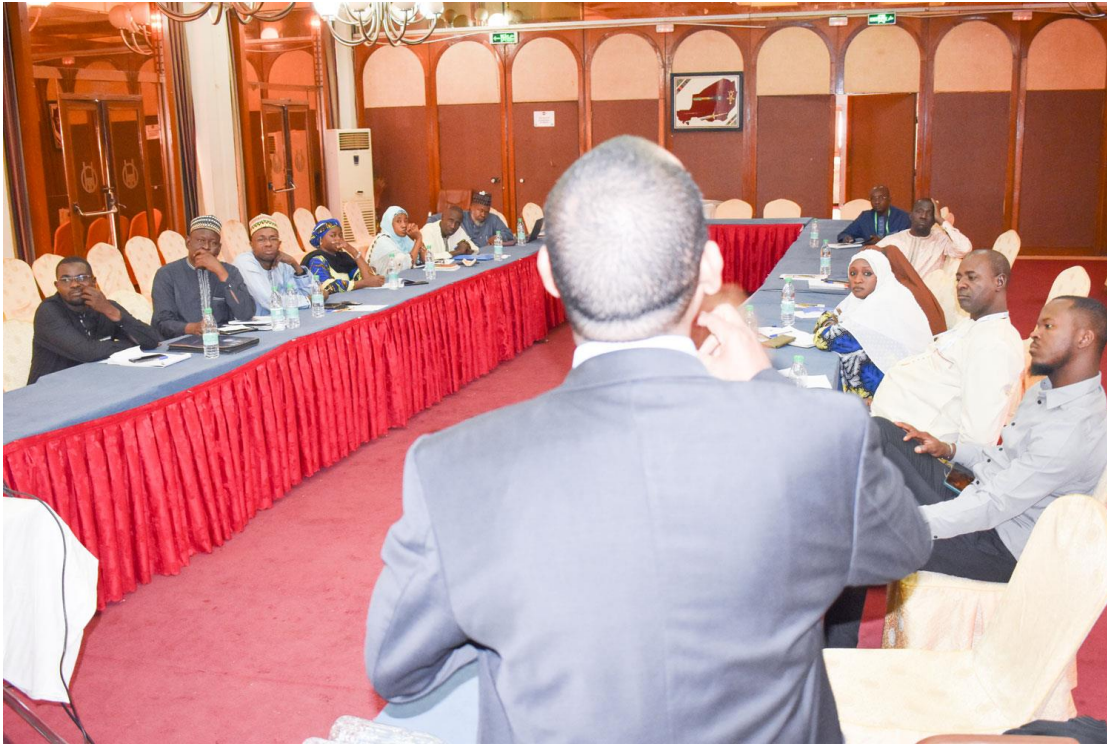
A cross section of the participants during the meeting

The End Child Marriage platform in Niger Republic made commitment to liaise with the dRPC to organize similar trainings on Safe Schools for CSOs, Teachers and the community leaders.