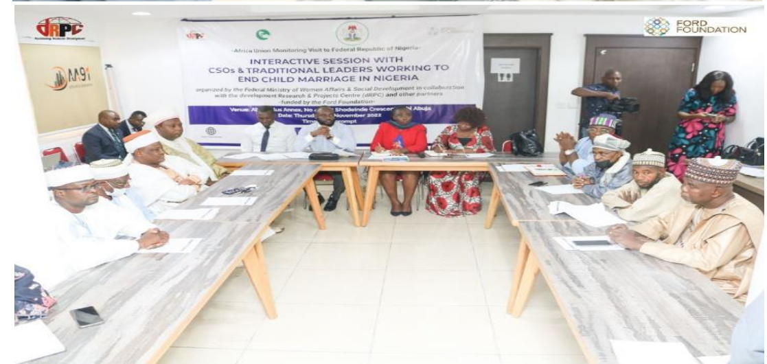
A cross section of the AUC's F1st and 2 nd Interactive meeting with Traditional and Religious leaders and CSOs respectively on Ending Child Marriage – 10 th November 2022