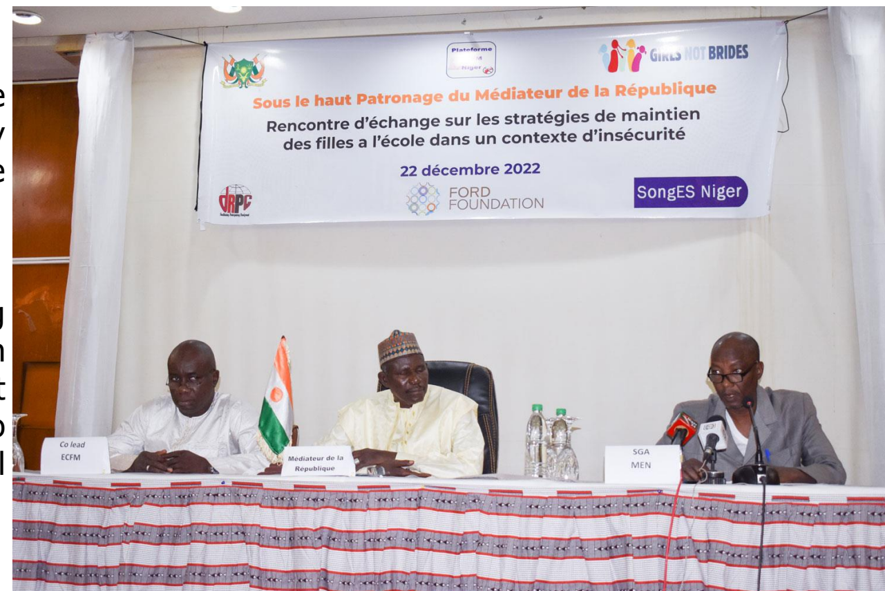
The Ombudsman of the Republic flanked by the Secretary General of the Niger Min. of Education and the coordinator the End Child Marriage Platform

The meeting featured presentation on the schools attacked in Niger and the dRPC's Work on School Safety in Nigeria: Lessons Learned.