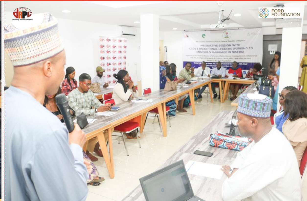
A cross section of the AUC's 1st and 2nd Interactive meeting with Traditional and Religious leaders and CSOs respectively on Ending Child Marriage - November 2022