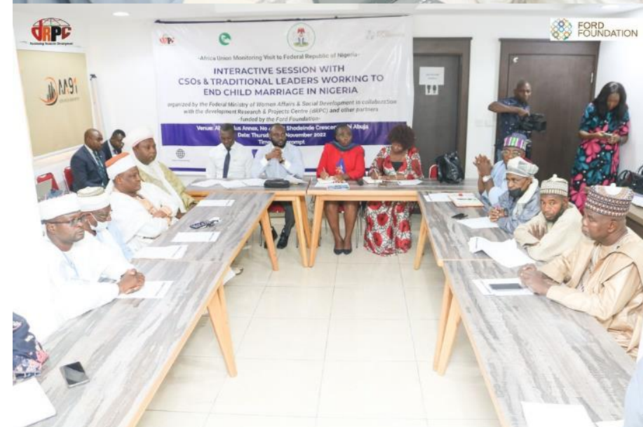
A cross section of the AUC's F1st and 2 nd Interactive meeting with Traditional and Religious leaders and CSOs respectively on Ending Child Marriage – 10 th November 2022