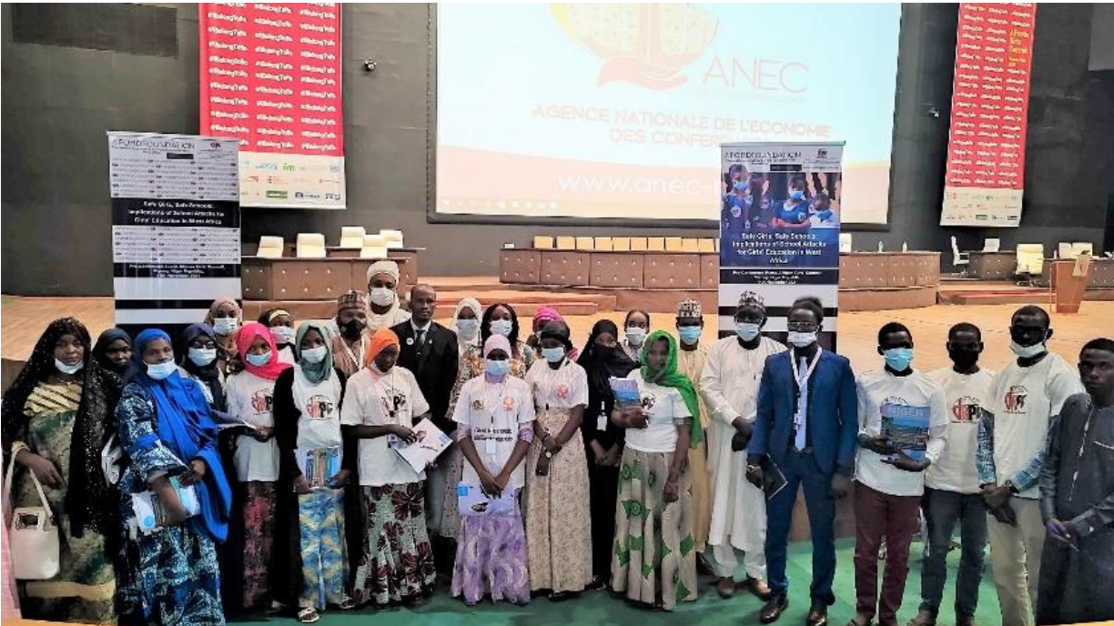
Group Picture of some of the participants of the dRPC's Session on Safe School and Safe Education in West Africa at the 3 rd African Girl Summit in Niamey, Niger