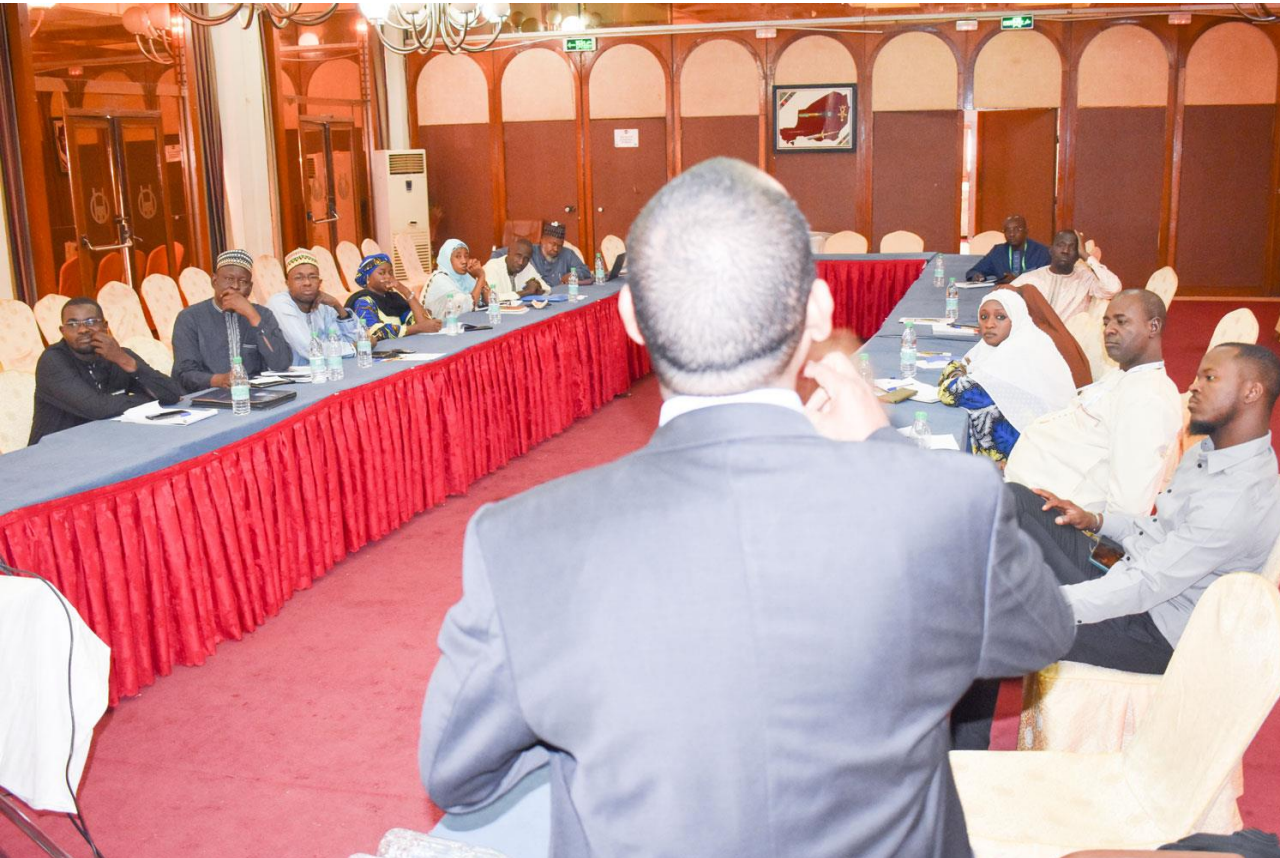
A cross section of the participants during the meeting

The End Child Marriage platform in Niger Republic made commitment to liaise with the dRPC to organize similar trainings on Safe Schools for CSOs, Teachers and the community leaders.