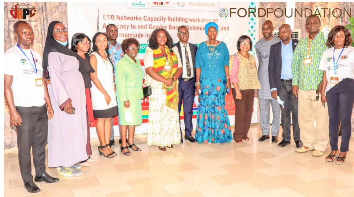
Group Photograph of participants during the workshop

The CSO and CSO networks working to put an end to child marriage and gender-based violence learnt about the emerging strategies for making schools friendly for girls, emerging opportunities, techniques and skills that can be adopted in the fight against GBV and child marriage. Some of the new skills and techniques will be implemented through effective advocacy messaging, plans and evidenced based data to make government officials to accelerate actions towards ending GBV and child marriage in West Africa.