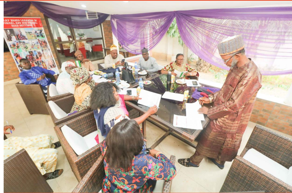
Group Photograph of participants during the workshop