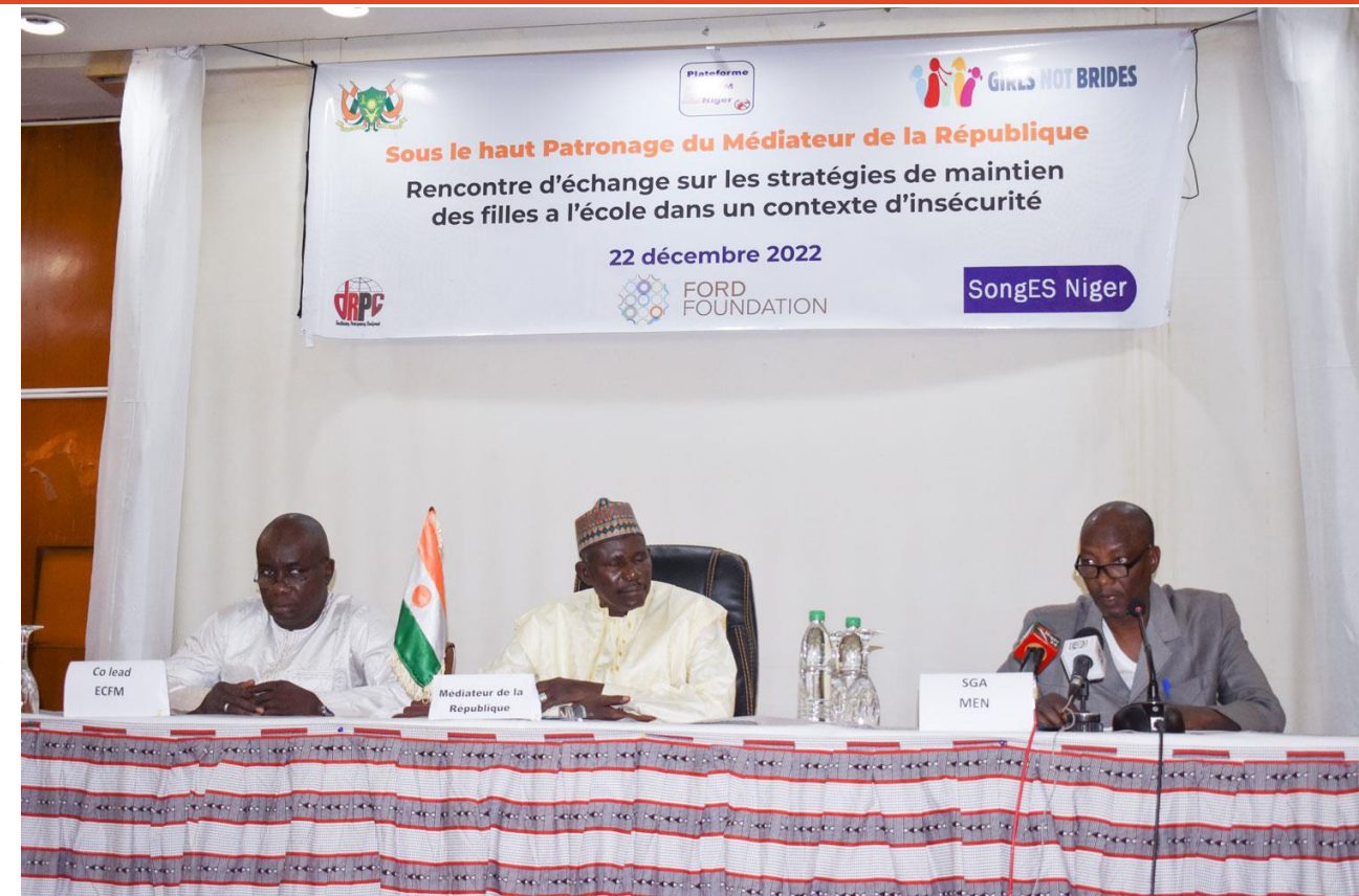
The Ombudsman of the Republic flanked by the Secretary General of the Niger Min. of Education and the coordinator the End Child Marriage Platform