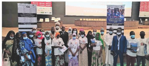
Déléguées étudiantes soutenues par la dRPC à la session Safe Schools du Sommet des filles africaines, 2021

Le Center Centre de Recherche et de Projets de Développement (development Research and Projects Center) (dRPC), une organisation non gouvernementale enregistrée avec plus de 20 ans d'expérience dans le domaine de l'éducation des filles, mettre fin au mariage des enfants, l'alphabétisation fonctionnelle et la sécurité des écoles en Afrique de l'Ouest. Le dRPC a organisé la session sur les écoles sûres lors du 3e Sommet africain des filles, organisé par le gouvernement de la République du Niger et l'Union africaine, du 16 au 18 novembre 2021.