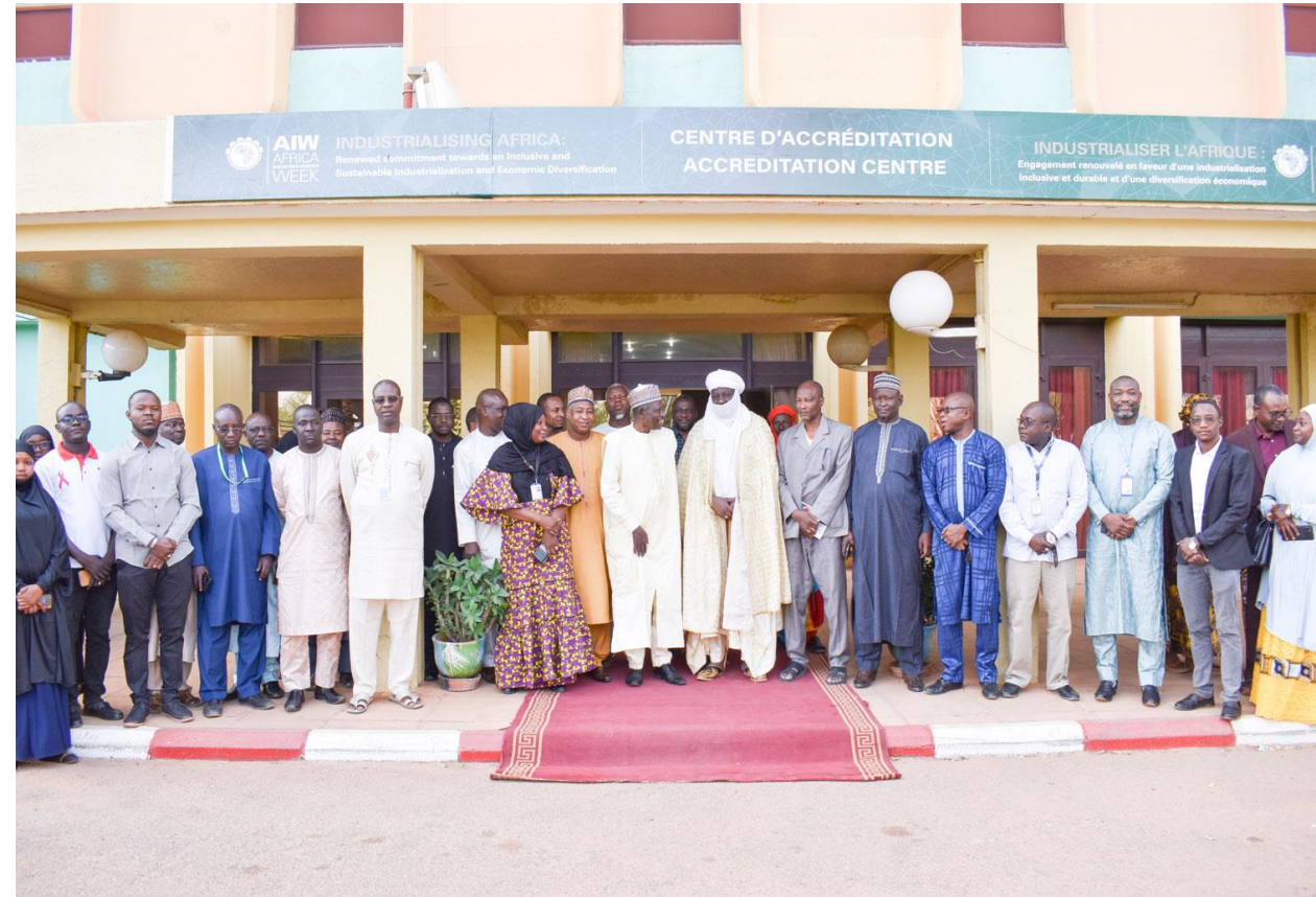
Group Photograph during the One-day advocacy meeting on Safe School in Niamey, Niger Republic