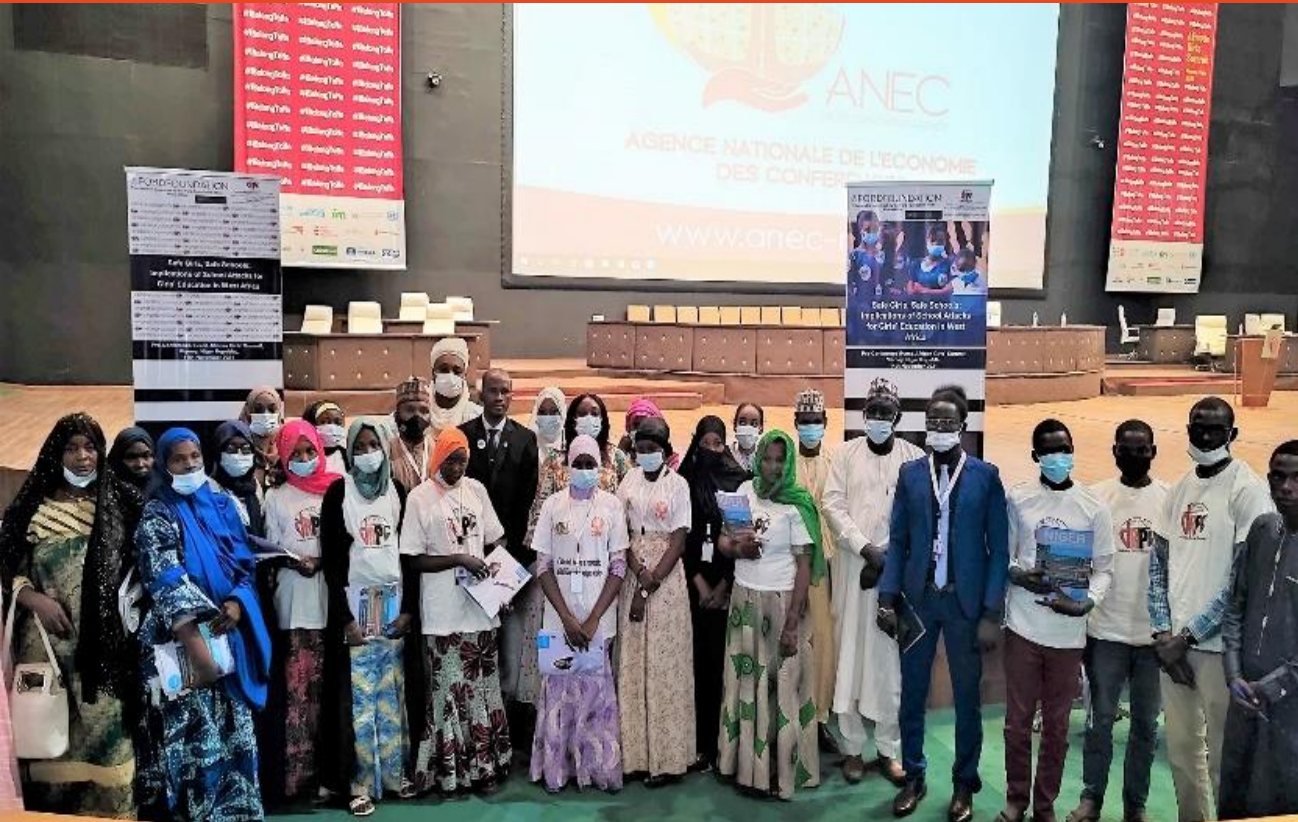
Group Picture of some of the participants of the dRPC's Session on Safe School and Safe Education in West Africa at the 3rd African Girl Summit in Niamey, Niger